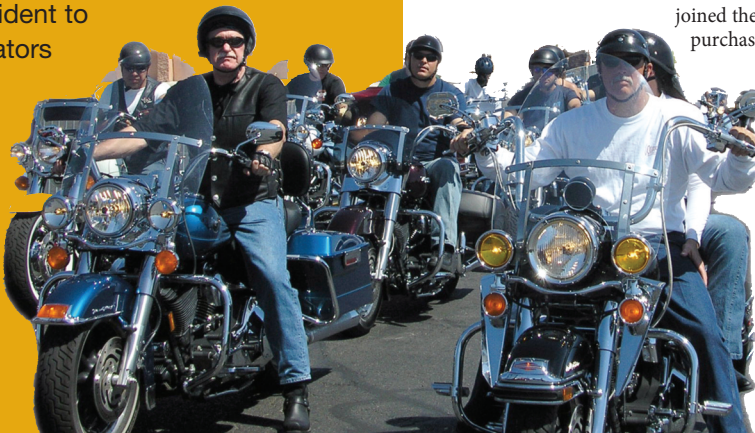
Inaugural Ride, August 2005, Las Vegas, Nevada

Additionally, 16 members (one from each of the districts represented by the IAFF) are appointed by the General President to serve as district event coordinators responsible for events and activities in their districts. Additionally, state/provincial coordinators have been appointed to assist the district event coordinators with support events and activities within their respective state or province.